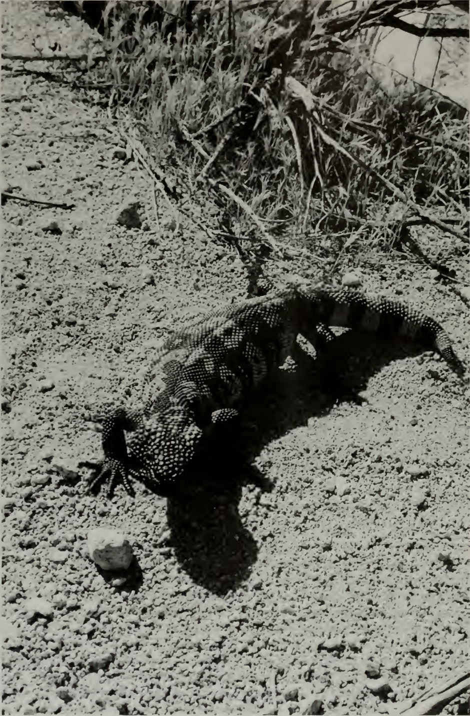
Fig. 7. Gila monster from the Kingston Range, San Bernardino County, California, 1.4 km west Porcupine Flats. Photo by Randall Ford, 30 May, 1980. LACMPC #1330.